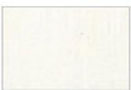
White NSC S0502Y